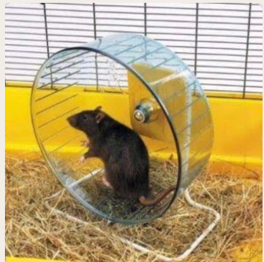
Savic Giant Rolly Wheel