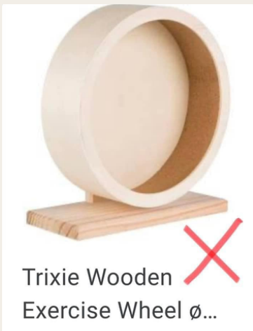
Trixie Wooden Exercise Wheel ø...