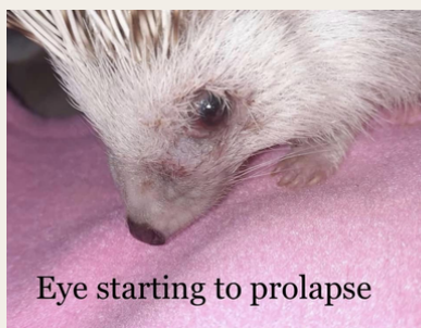
Eye starting to prolapse